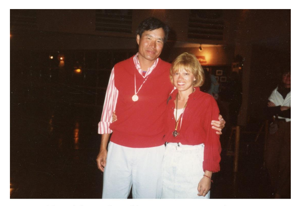
Gold Medal Mixed Doubles, American Zone Champions, 1997 Club Med World Amateur Tennis Tournament in Mexico

In 1997, I competed in the Club Med World Amateur Tennis Tournament in Mexico and won Gold Medal Mixed Doubles, America Zone (N. and S. America)